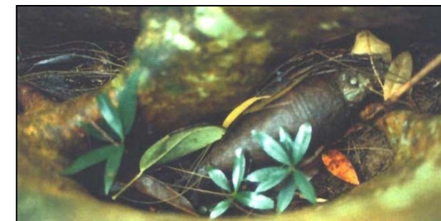
Figure 2 - 81-mm Mortar

Project Property History. The U.S. Army acquired 2,545 acres in Kahana and Punaluu Valleys between 1943 and 1947. The Pacific Jungle Combat Training Center was established and used as a unit level jungle combat center to supplement Department Ranger and Combat School Training. The Center was divided into three courses: Red, Blue, and Green. Basic jungle warfare was conducted at the Red and Blue courses. Advanced jungle warfare training and Instructor Jungle Training School were conducted at the Green course. Munitions known to have been used or recovered include 75-millimeter (mm) armor piercing (AP) rounds, 105-mm high explosive (HE) rounds, 81-mm HE and practice mortar rounds, and small arms. In 1946, parcels in Kahana Valley were returned to its landowner. Leases and licenses for parcels in Punaluu Valley were terminated between 1945 and 1950. De-dudging efforts were conducted in Punaluu Valley in 1949.